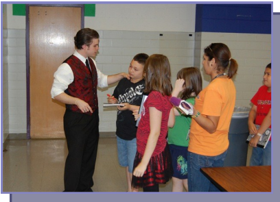
Magician takes time to talk w/students after show