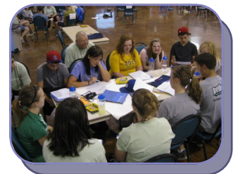
2011 Key Leader At Sky Ranch